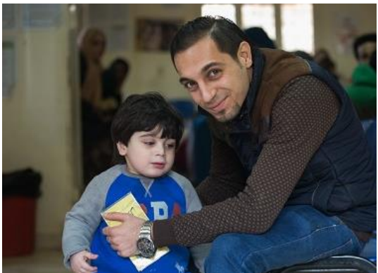
Syrian father and son in UNHCR reception area

Both Cairo and Alexandria are areas where large numbers of Syrian nationals are settled. Once in force, this new development is expected to greatly enhance the protection environment for Syrians residing in and around Alexandria, as it will save them the expense, time and efforts of traveling to the capital every six months for the renewal of their documents.