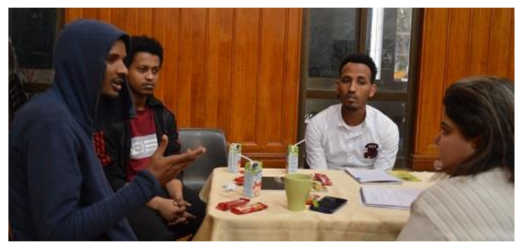
Refugees and UNHCR staff member during consultations for the annual Participatory Assessment.

(463 children, 640 adults; 575 females, 528 males). Consultations with the community focussed on the overall protection environment, access to UNHCR and partners' services, documentation, and the impact of health and education mainstreaming into national services. During the consultations, refugees and asylum-seekers talked about the difficulties they face, how they cope with these challenges, and suggested ideas and solutions to be implemented by UNHCR and the refugee community. These discussions guide UNHCR's planning for 2018 . A comprehensive report of the findings will be released in the second quarter of 2017.