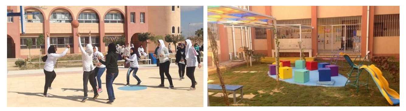
Newly established basketball court and nursery playground in Alexandria.